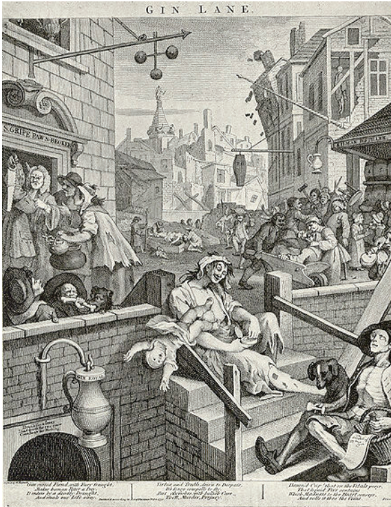
XXIX. GIN LANE. 1751. Engraving. 11 3/8 x 14 in.

the naked with a garment. Indeed the whole form of their life was changed: they had 'left off doing evil, and learned to do well.'"